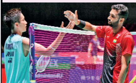
Japan's Kento Momota (L) congratulates India's Prannoy H S after their men's singles match on day three of the Badminton World Championships in Tokyo

H S Prannoy stunned second seed Kento Momota in straight games to record a sensational win while reigning Commonwealth Games champion Lakshya Sen also sailed into the men's singles pre-quarterfinals of the World Championships here on Wednesday. Unseeded Prannoy rose above expectations to shut the door on crowd favourite and two-time former world champion Momota 21-17 21-16 in a second-round tie. Incidentally, it was Prannoy's first win over Momota in eight matches. In their previous clashes, the Indian won only one game against his higher-rated Japanese rival.