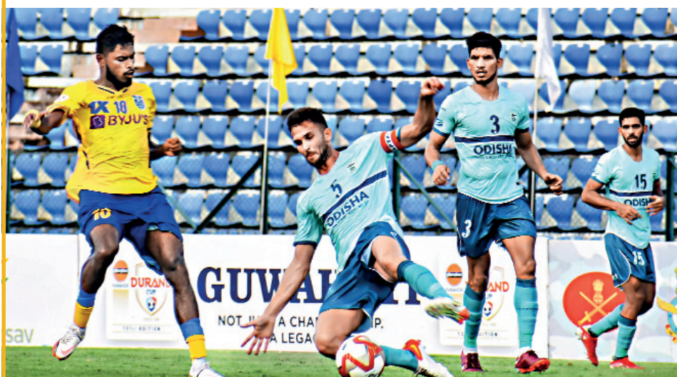
Players of Kerela Blasters FC (yellow) and Odisha FC vie for the ball during their Durand Cup 2022 football match, at Indira Gandhi Athletic Stadium, in Guwahati, Tuesday.