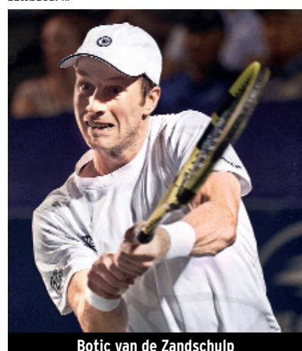
Botic van de Zandschulp

bia's Laslo Djere in the round of eight. Gasquet defeated American Steve Jonson 6-7 (3), 6-3, 6-3, while Djere moved on with a 7-6 (4), 6-7 (9), 6-3 win over Australia's Jason Kubler. AP