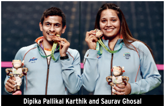
Dipika Pallikal Karthik and Saurav Ghosal

Q1: Dipika Pallikal Karthik and Saurav Ghosal defeated players of which country in the squash mixed doubles semi-finals at CWG 2022?