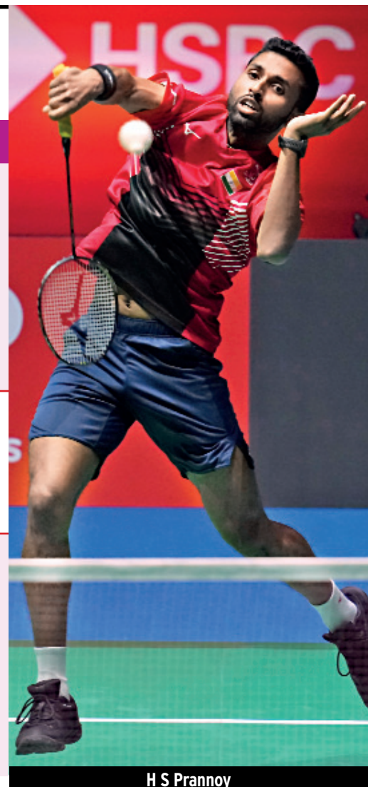
H S Prannoy