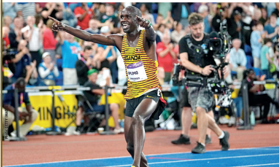
Uganda's Jacob Kiplimo celebrates after winning the gold medal in the men's 10,000m final during the athletics in the Alexander Stadium at the Commonwealth Games in Birmingham, England, Tuesday.