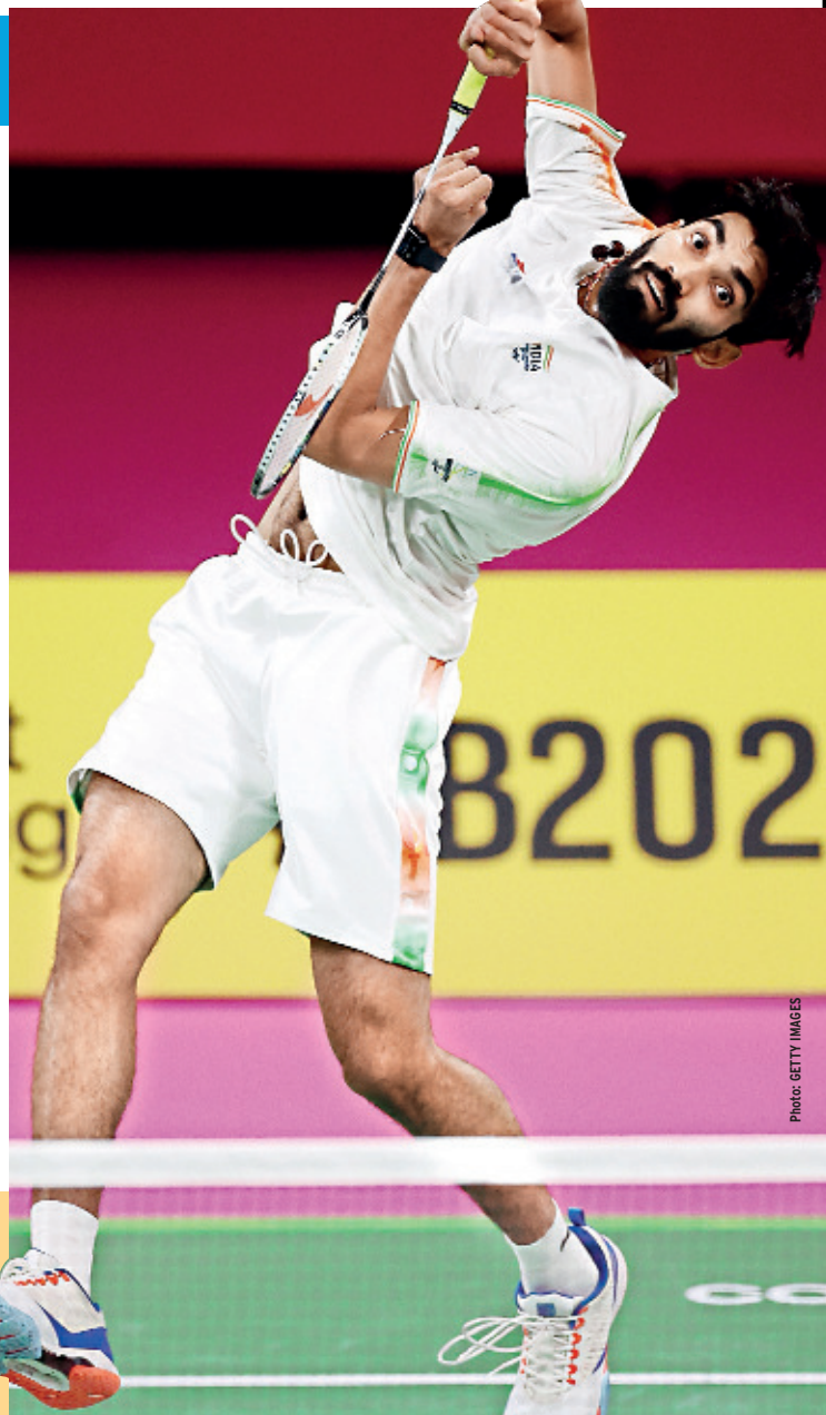
Kidambi Srikanth competes during Badminton men's singles - gold medal match between Malaysia and India on day five of the 2022 Commonwealth Games in Birmingham, England

Long jumpers Murali Sreesankar and Muhammed Anees Yahiya confirmed their berth in the final as did Manpreet Kaur for the women's shot-put final.