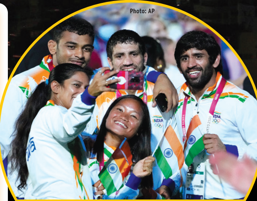
Athletes from India are all smiles as they take a selfie during the closing ceremony