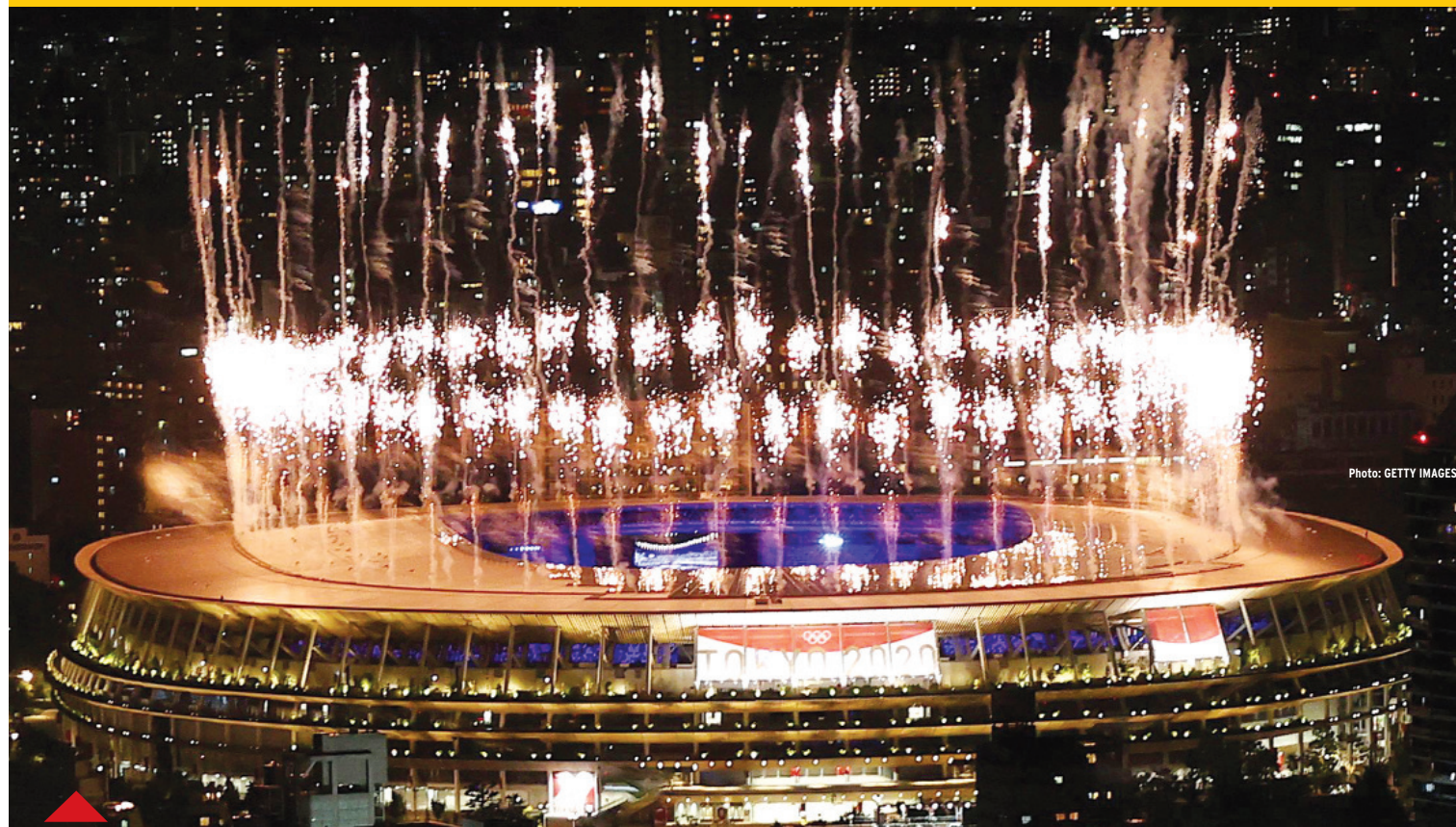
Fireworks erupt above the stadium during the closing ceremony of the Tokyo 2020 Olympic Games at Olympic Stadium

As one of the most challenging Olympic Games ever come to a close, the closing ceremony was spectacular, yet unprecedented, with the 68,000-seat Olympic Stadium empty of spectators