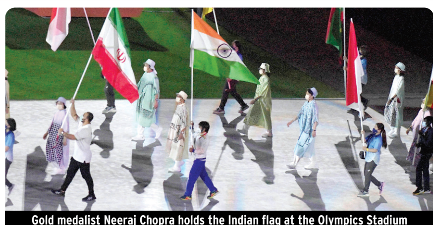
Gold medalist Neeraj Chopra holds the Indian flag at the Olympics Stadium