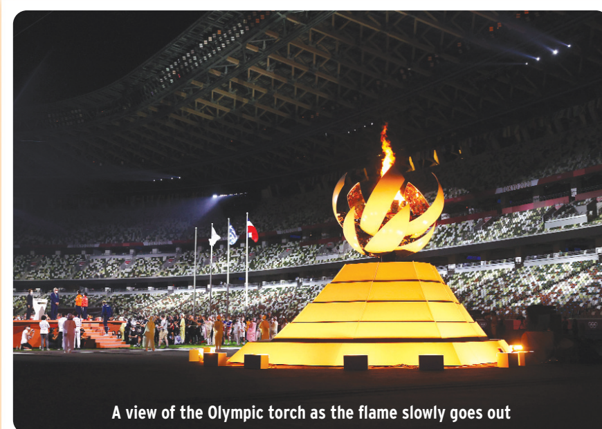
A view of the Olympic torch as the flame slowly goes out