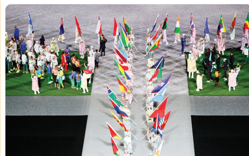
A view as the flag bearers of the competing nations enter the stadium