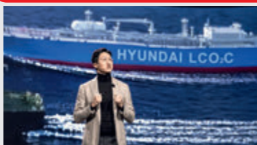
IN THE NEWS FOR: Kisun Chung, CEO, HD Hyundai Co., at 2024 CES in Las Vegas. The event typically doubles as a preview of how tech giants and startups will market their wares. Early announcements indicate that AI-branded products will become the new 'smart' gadgets of 2024

QUESTION: Assertion: International trade has undergone a sea of changes in the last decades. Reason: Exchange of commodities and goods have been superseded by the exchange of information and knowledge.