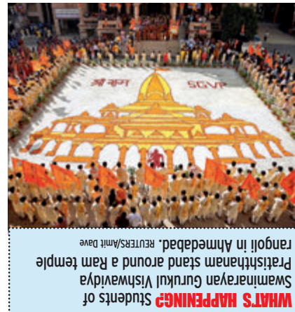
WHAT'S HAPPENING? Students of Pratistha stand around a Ram temple rangoli in Ahmedabad.

3. Flower rangolis are more eco-friendly. But how can one dispose of the flowers ethically? Write two ideas.