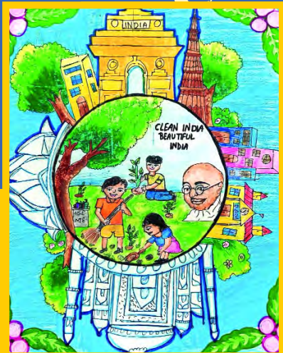
SAKSHI THAKUR, class VI-C, DAVPS Pushpanjali Enclave