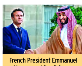
French President Emmanuel Macron and Saudi Crown Prince Mohammed bin Salman

Paris, France: Energy was the main topic on the agenda between French President Emmanuel Macron and Saudi Crown Prince Mohammed bin Salman, during talks in Paris seen as a diplomatic rehabilitation of the de facto leader of the Saudi kingdom. Aides to the French President had indicated ahead of the talks that Macron would urge Saudi Arabia to