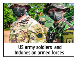
US army soldiers and Indonesian armed forces

Sumatra, Indonesia: Thousands of Indonesian and American troops began a two-week joint military exercise on August 1 that Washington said aims to advance "regional cooperation in support of a free and open" Asia-Pacific region. The US and its Asian allies have expressed growing concern about China military machinations. AGENCIES