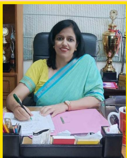
ing with their unwavering dedication.

I must also add here the bravery and courage of the millions of young warriors world over who despite all odds kept the flame of education and knowledge burn-